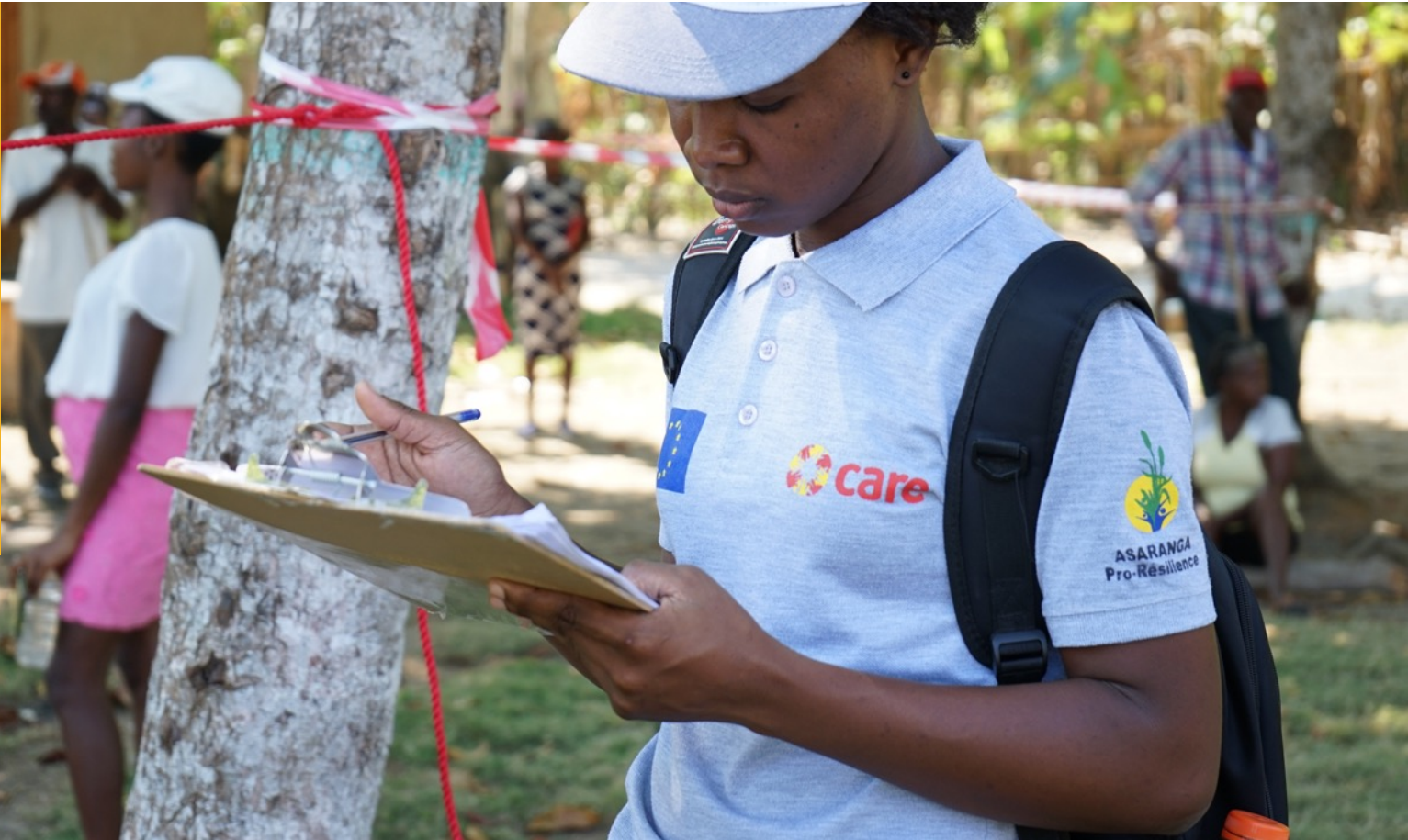
Distribution of Hygiene Kits and cash in Haiti