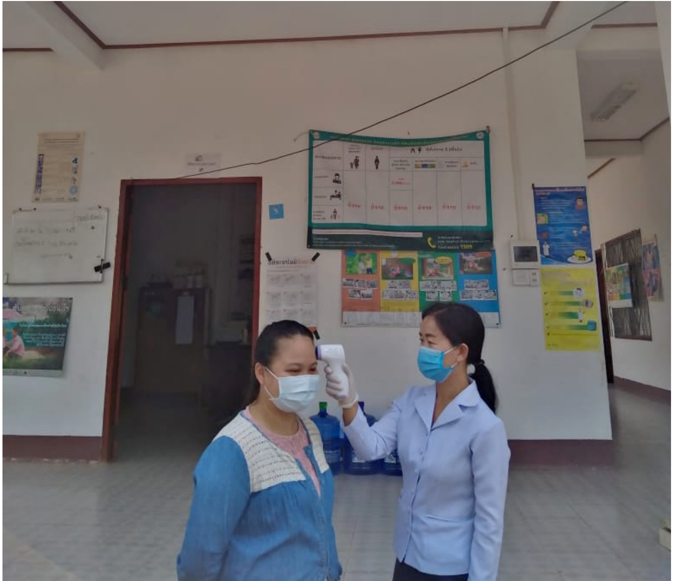
Medical equipment donated by CARE in use at health centers