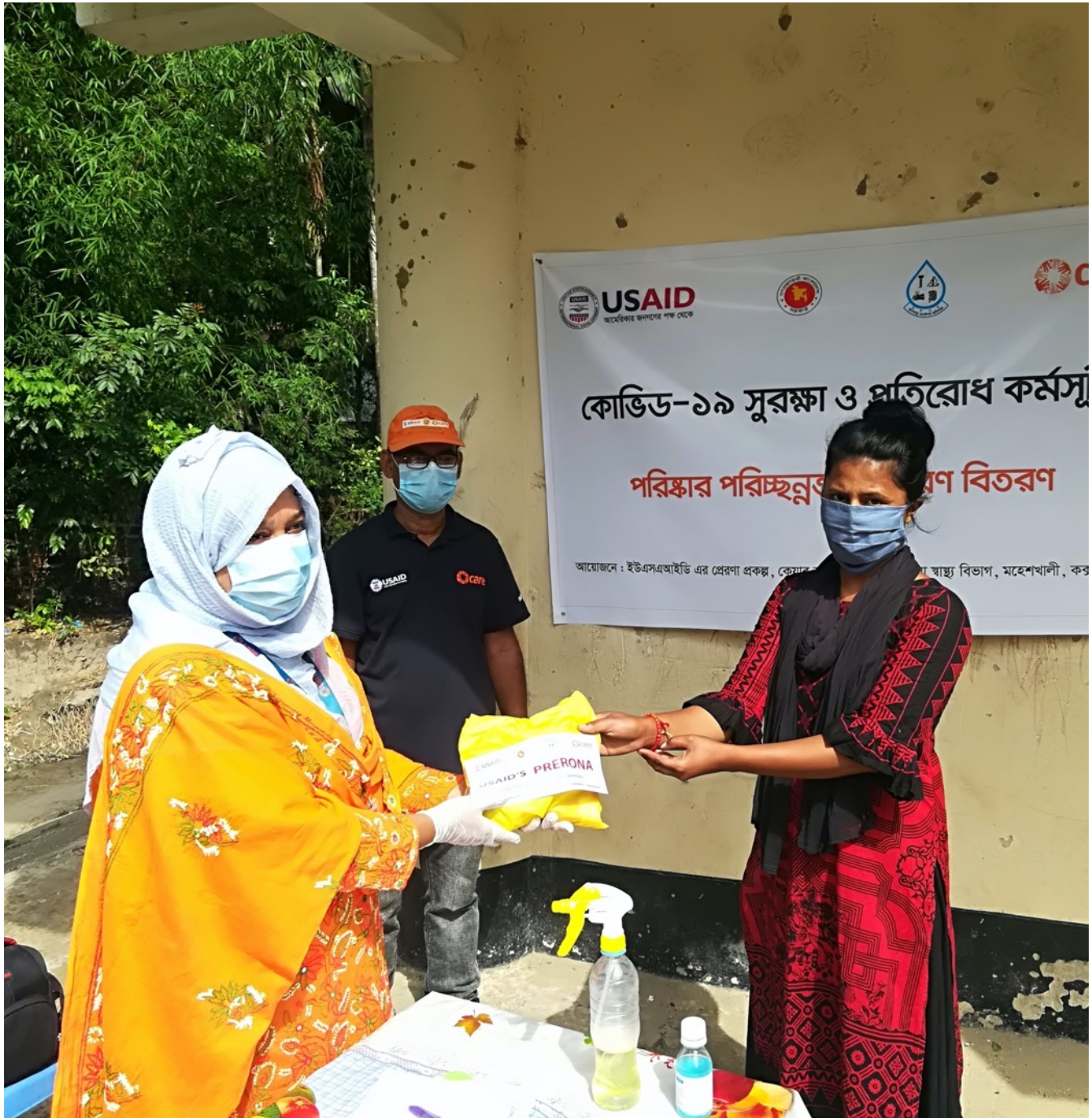
COVID-19 response teams in Bangladesh