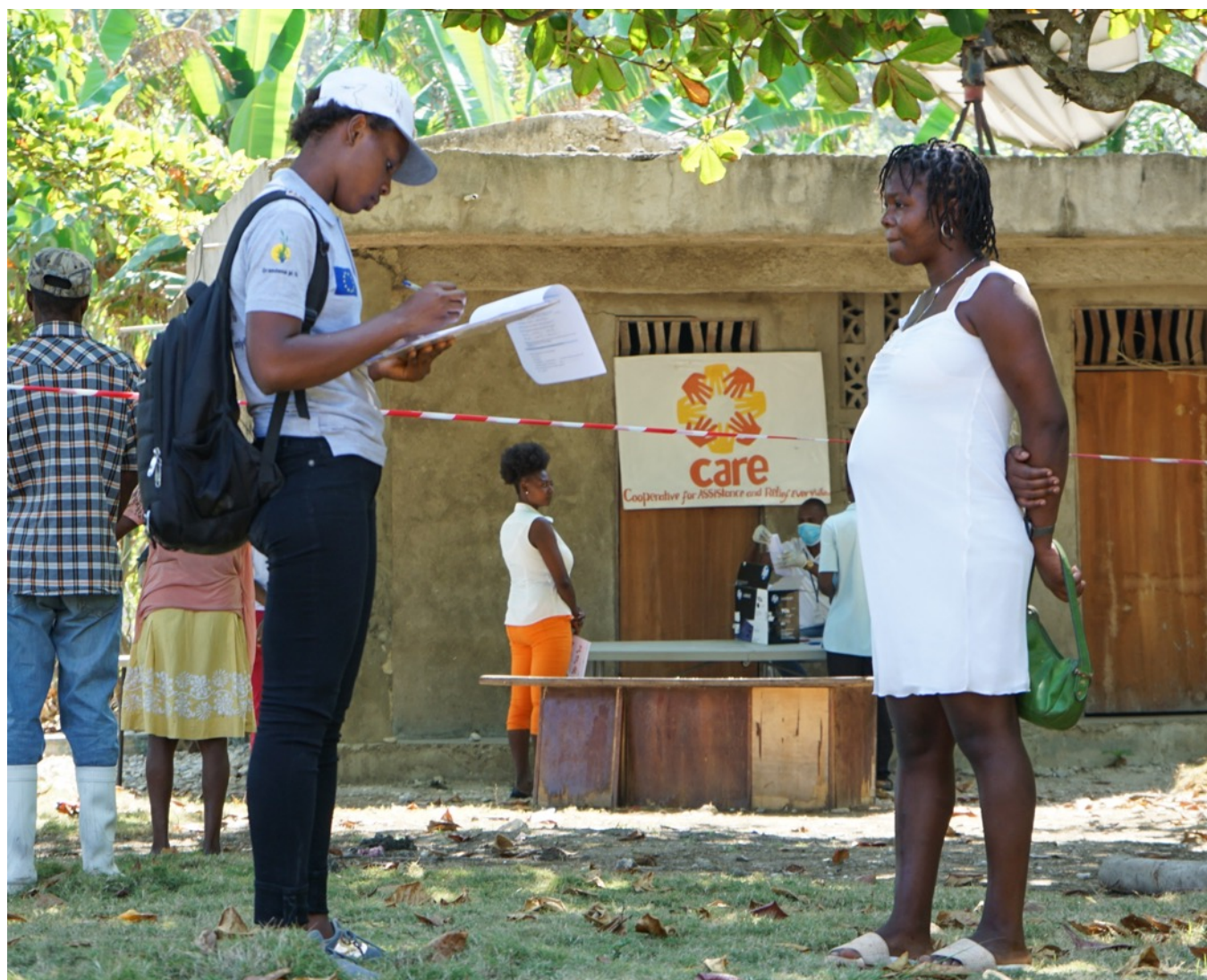
Distribution of Hygiene Kits and cash in Haiti

Despite evidence that demonstrates women's essential contributions, these are often not valued, recognized, or supported by the humanitarian system. Because men have largely designed and led humanitarian assistance programming, services such as GBV and SRH are not always considered immediate needs on par with food or shelter—despite the fact that women's need for them increases during crises and that these services save lives. Women face the same barriers to their participation in the humanitarian system that they do in society, writ-large—including unequal caregiving burdens, lack of compensation, increased risk of violence, and the unequal nature of partnerships with international actors—as well as additional barriers, such as the threat of GBV. Women humanitarian responders also report that the work they do is not taken as seriously and that their voices are not as well respected as those of men. 68