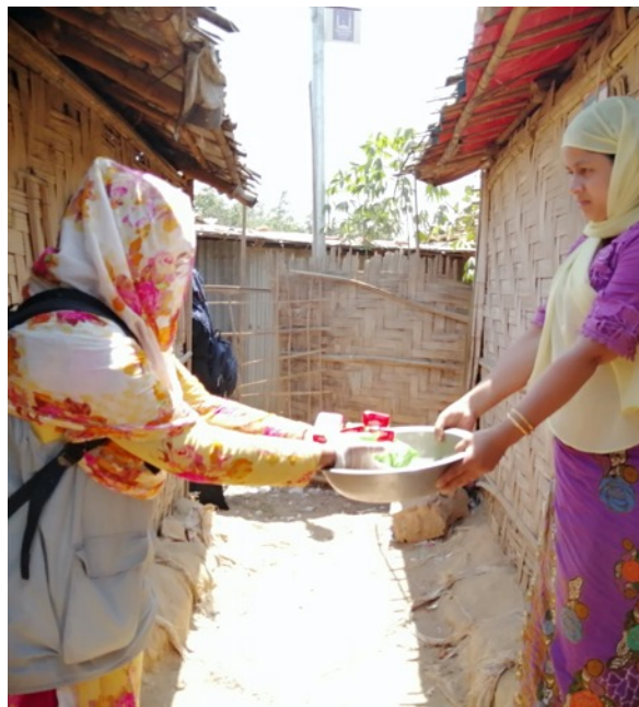
Awareness raising, soap distribution and collection at household level Cox’s Bazar

The evidence is clear: COVID-19 is disproportionately affecting women and girls. Given that, it is all the more important that COVID-19 responses are gendered, and that women and girls are able to participate in making the decisions that affect them, as is their right. Although women are on the frontlines of the crisis in their homes, communities, and health care facilities, they are often excluded from the community and national decision-making processes and governance structures that determine the response.